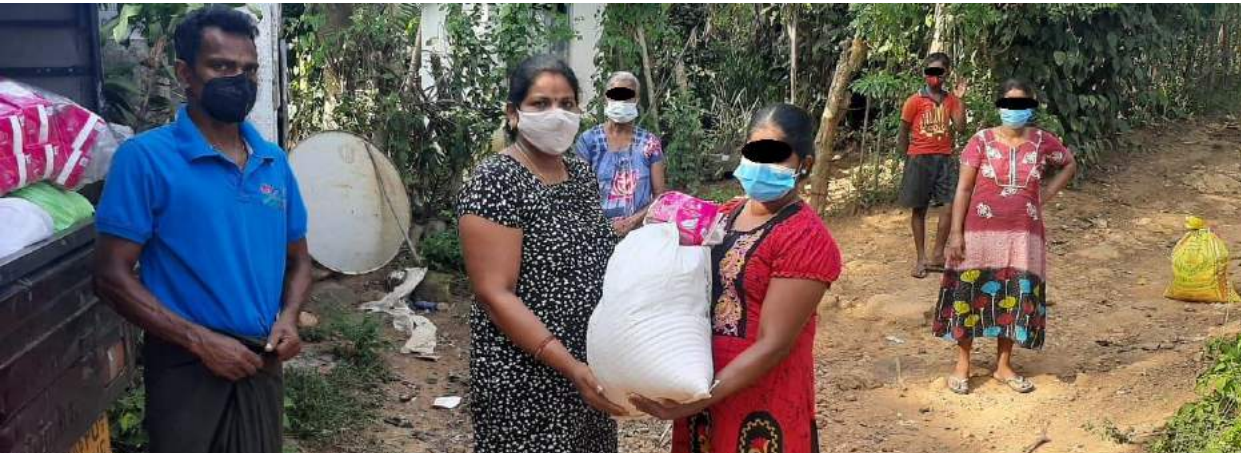
Samsung Tripl Shot with my Gale