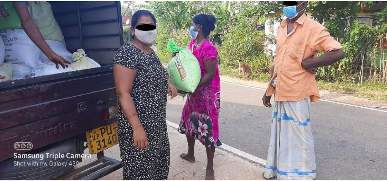
Samsung Triple Camera Shot with my Galaxy A30