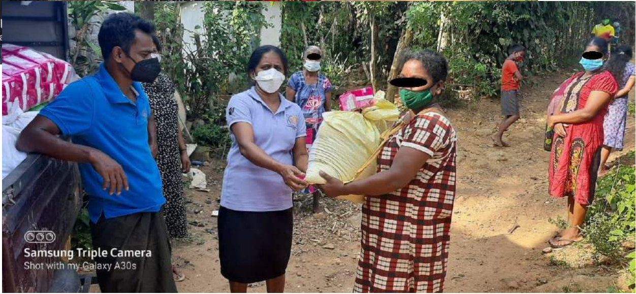
Samsung Triple Camera Shot with my Galaxy A30s