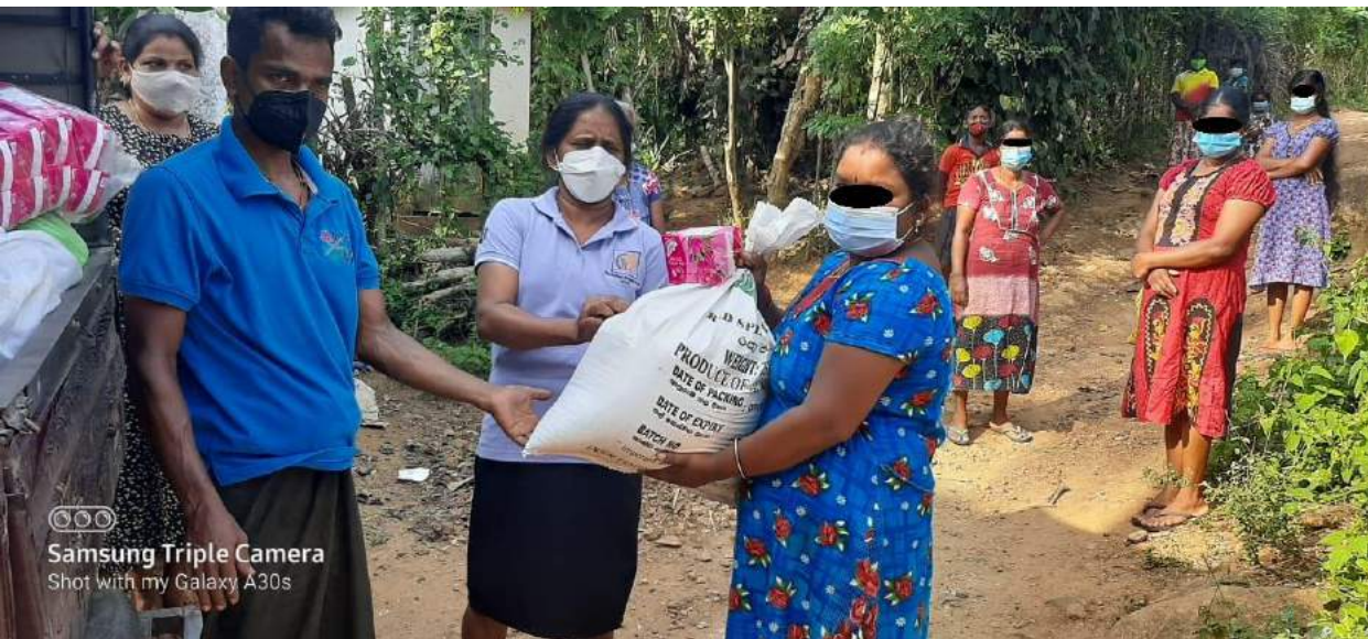
Samsung Triple Camera Shot with my Galaxy A30s